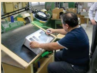
Seated de-burring and angled operation