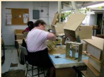
Masking operation using hand to support part

THE LATEST WCTI INFORMATION Shared claims, prospect referrals information and new members.