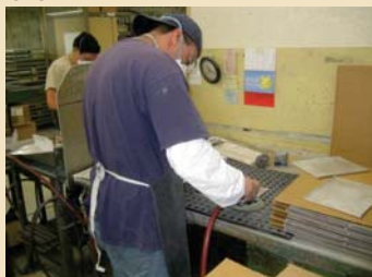
Standing during de-burring operation